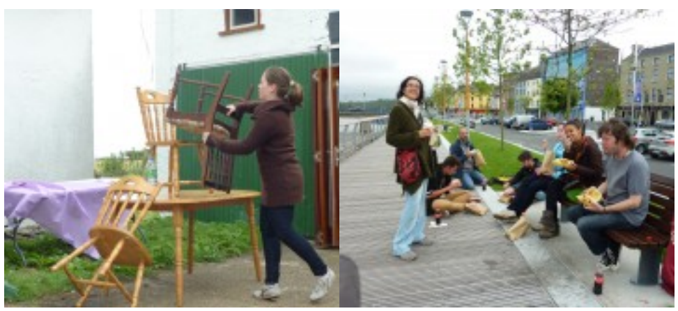
Explore oppression and power in society

Images of oppression: Each group were asked to come up with an image of oppression in society. Show and discuss.